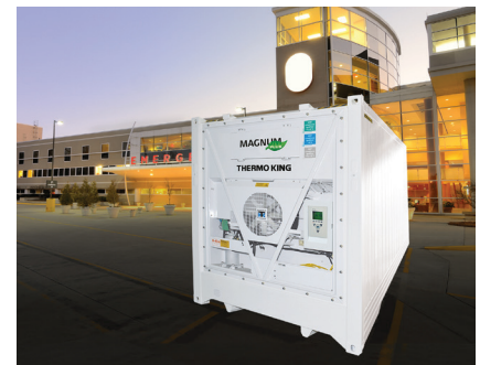
Magnum® Plus or Superfreezer - For mobile, temporary cold storage for larger quantities at temp ranges from -70C to +40C.