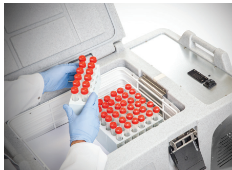
Coldtainer from Thermo King - For use in trucks, vans, or within hospitals. Storage temps ranging from -24C to +30C.

We offer several mobile refrigeration and storage units that can safely transport pharma cold chain products in any environmental condition. Whether you need a blood transport cooler, portable vaccine refrigerator, cooled transport of biological samples, or temperature-controlled shipping unit for vaccines and medicines, we have a solution.